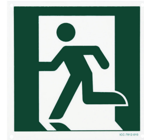
Left Running Man Sign

INSTALLATION EASE The Running Man Signs come with either self-adhesive tabs or can be mechanically fastened through pre-drilled holes. Installation and maintenance manuals are available at www.babcockdavis.com .