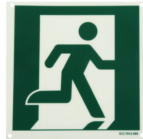
Right Running Man Sign