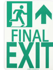
Running Man Final Exit