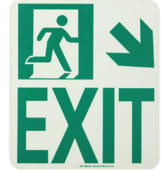
Running Man Arrow Exit