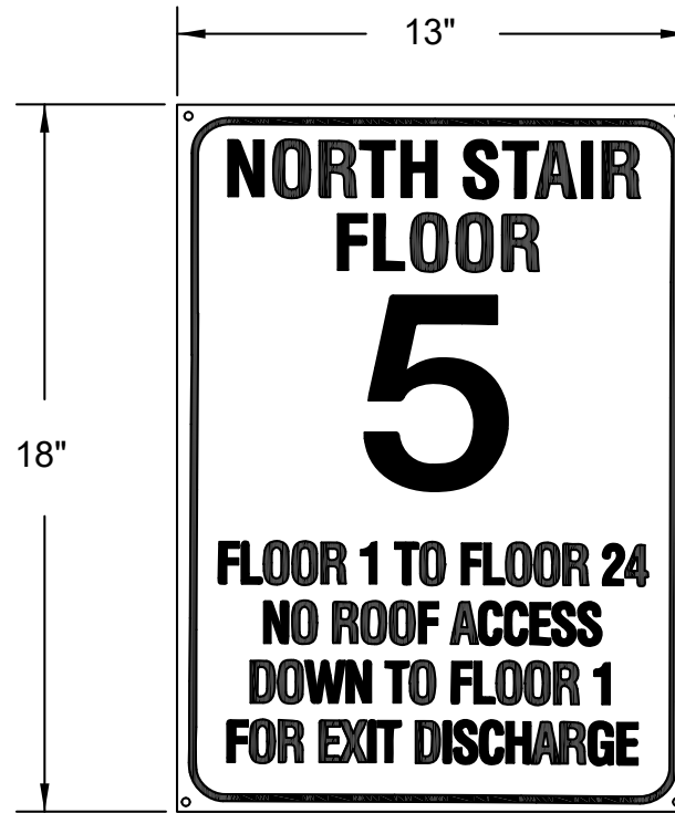
BEM-SFI-13X18 Floor Identification