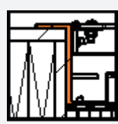
Angle Frame Bolt-In