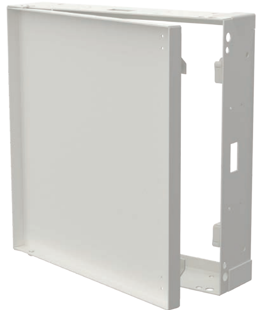
BR Series Recessed Access Door

Rough opening is door size + 1/4 inch minimum. Additional sizes available, call for more information.