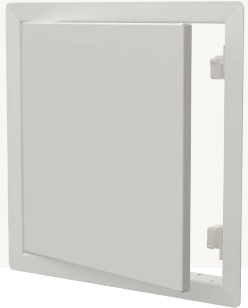
BN Series Access Door