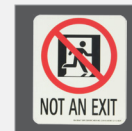
Not an Exit Sign