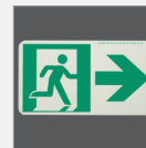
Running Man with Arrow