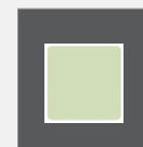
Door Latch Marking