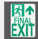
Running Man Final Exit