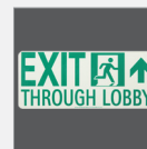
Lobby Exit with Arrow