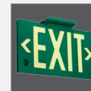
2-Sided Exit Sign