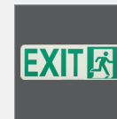
Running Man Exit