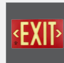
1-Sided Exit Sign