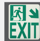
Running Man Arrow Exit