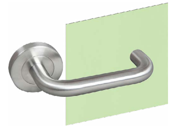
Die Cut Tape

INSTALLATION EASE Labor saving features like peel-and-stick adhesives require no special tools and no special training. Installation and maintenance manuals are available at www.babcockdavis.com .