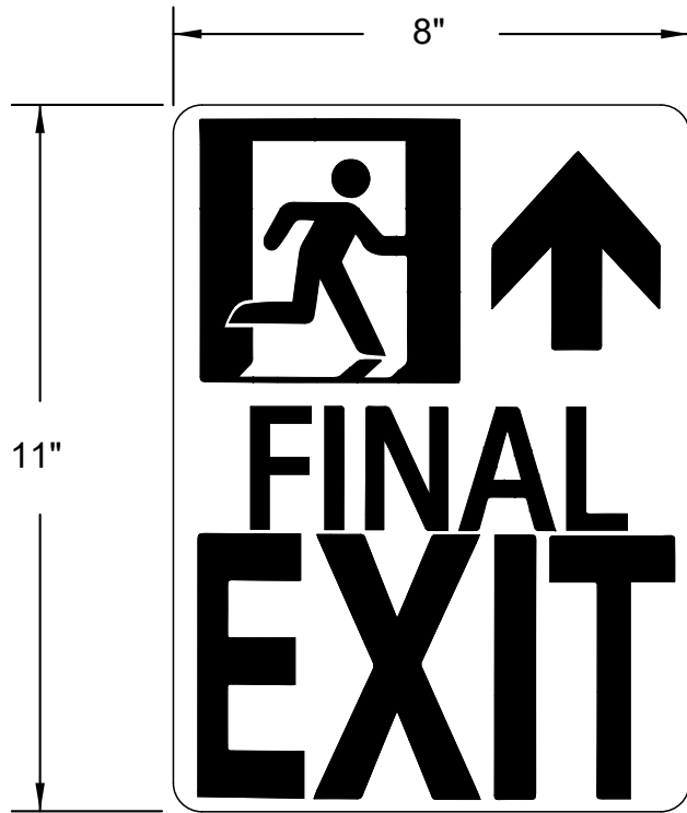
BEM-SREFAR-8X11 (Shown) Running Man Exit Final Arrow Right