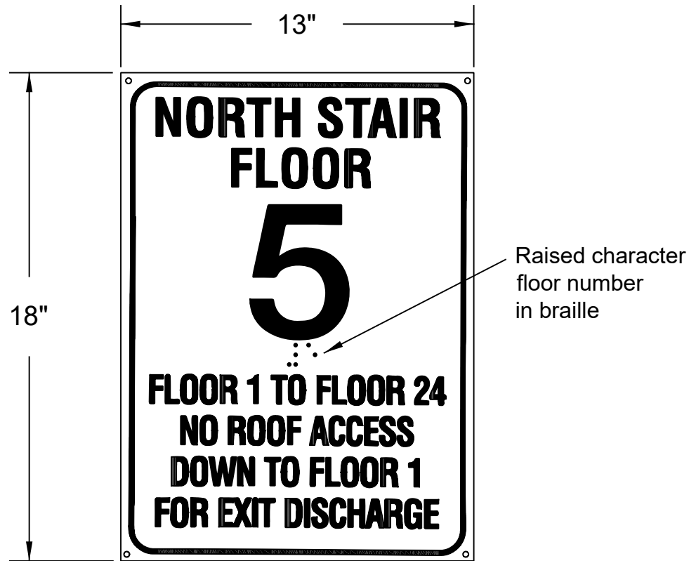
BEM-SFI-13X18 Floor Identification